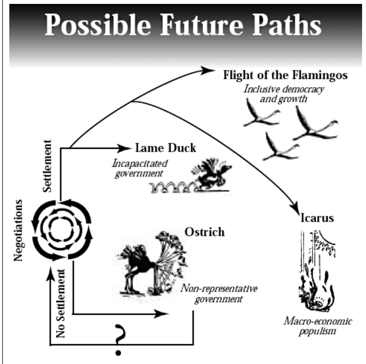
Figure 1 The Mont Fleur Scenarios (Weekly Mail, 1992)

new direction was emerging. A consensus was achieved with signatories to the NHS Plan from many surprising bedfellows in the various stakeholder groups in the NHS. But the results were slow and frustrating to the political elite, informed by media horror stories and irritated focus group feedback.